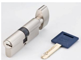
D810 Mortise Dead bolt

COPYRIGHT © LUTER ENTERPRISE CO., LTD. All Right Reserved.